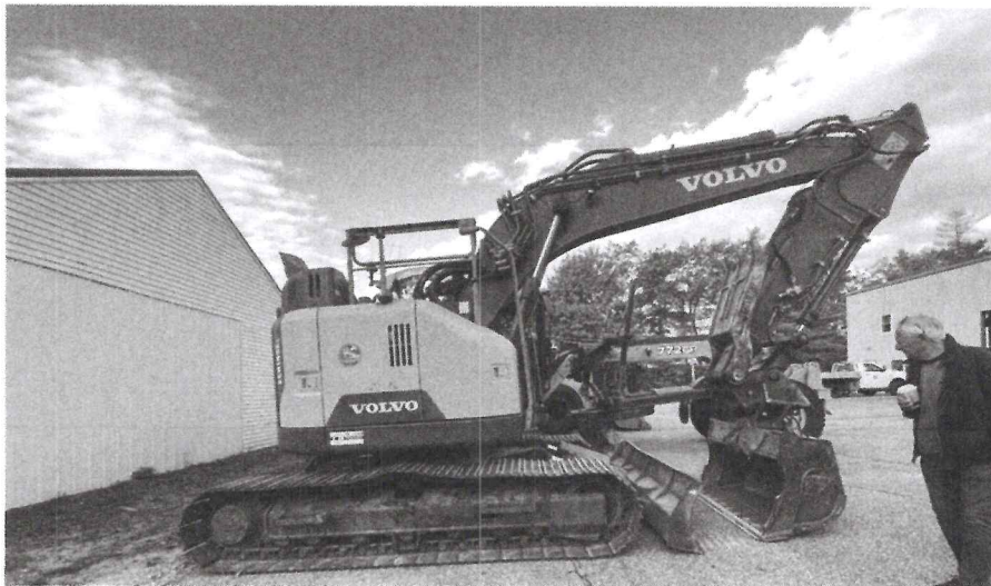
Vehicle 39: 2018 Volvo ECR145EL Excavator (HWY) Scheduled Replacement Year FY2038, $187,400