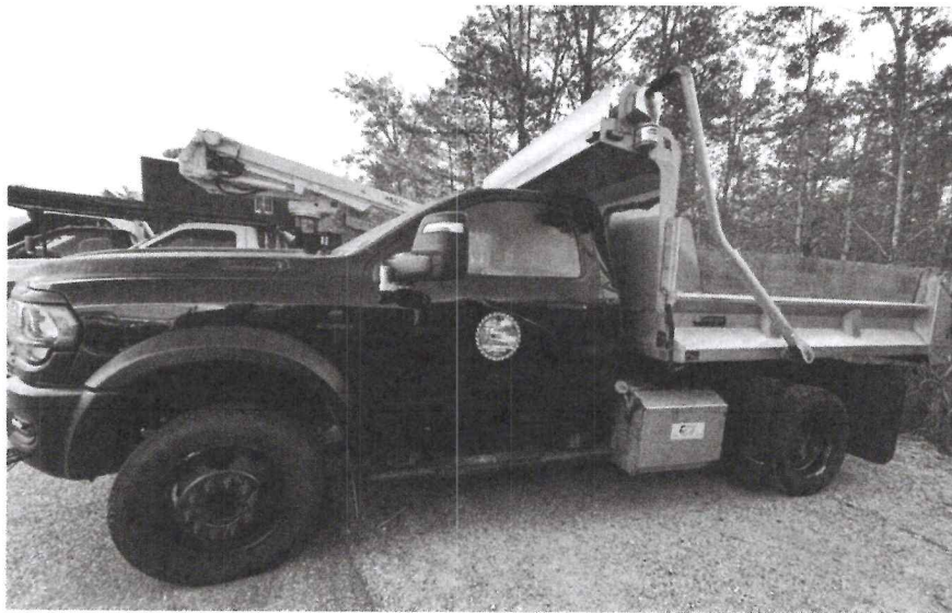
Vehicle 2: 2024 19.5K Dump Truck with Plow, Wing, and Sander (HWY) Scheduled Replacement Year FY2034, $160,000