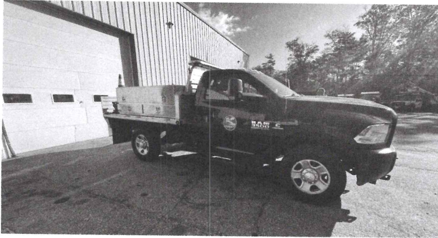
Vehicle 3: 2018 RAM 3500 4x4 Fleet Pick-Up with Plow and Sander (HWY) Scheduled Replacement Year FY2028, $110,000