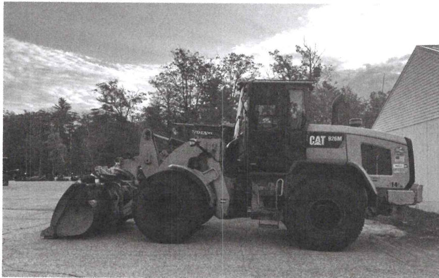
Vehicle 14: 2015 Cat 926M Loader (HWY) Scheduled Replacement Year FY2030, $175,000