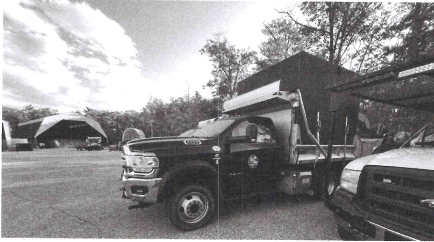
Vehicle 5: 2022 19.5K Dump Truck with Plow, Wing and Sander (HWY) Scheduled Replacement Year FY2032, $160,000