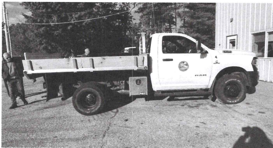
Vehicle 4: 2022 RAM 3500 4x4 Fleet Pick-Up Series (B&G) Scheduled Replacement Year FY2032, $100,000