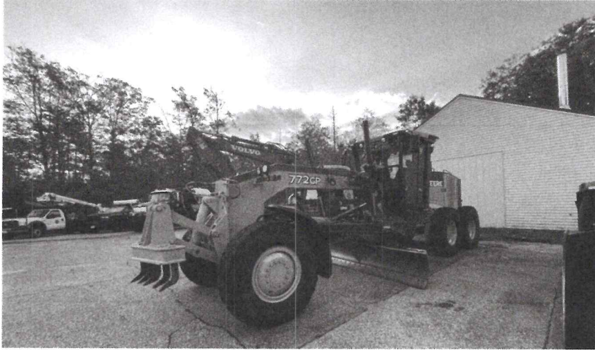
Vehicle 23: 2009 John Deere 772G Grader (HWY) Scheduled Replacement Year FY2029, $500,000