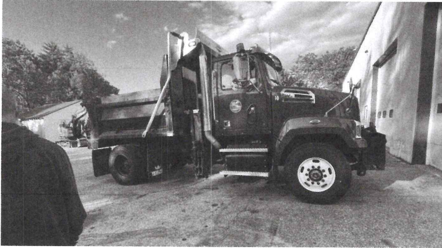
Vehicle 10: 2021 47K Dump Truck with Plow, Wing, and Sander (HWY) Scheduled Replacement Year FY2034, $200,000