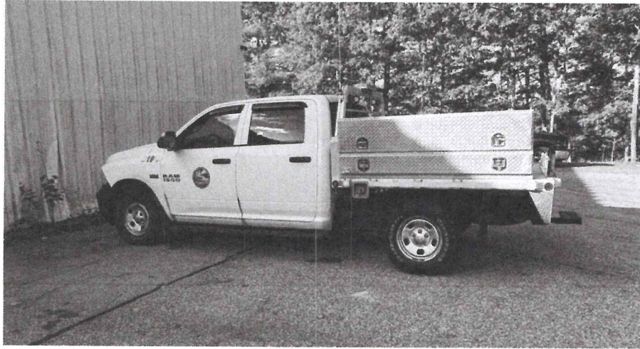
Vehicle 19: 2018 RAM 1500 4x4 Fleet Pick-Up Series (B&G) Scheduled Replacement Year FY2028, $100,000