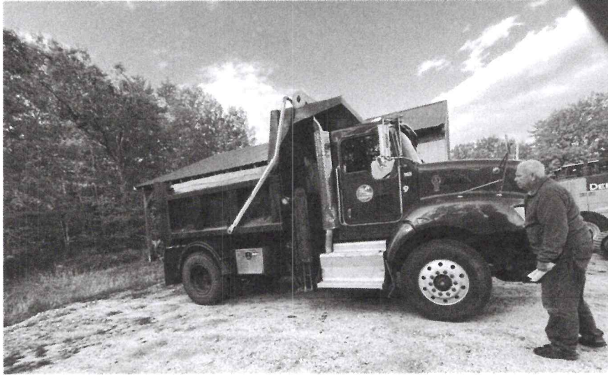
Vehicle 9: 2014 Kenworth 47K Dump Truck with Plow, Wing, and Sander (HWY) Scheduled Replacement Year FY2027, $200,000