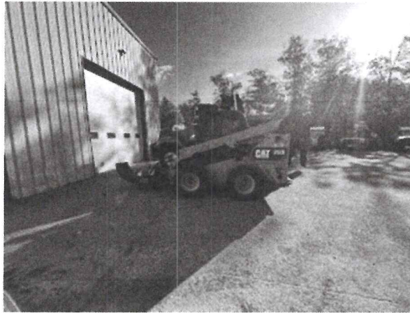
Vehicle 16: 2015 CAT 262D Skid Steer (HWY) Scheduled Replacement Year FY2035, $50,000