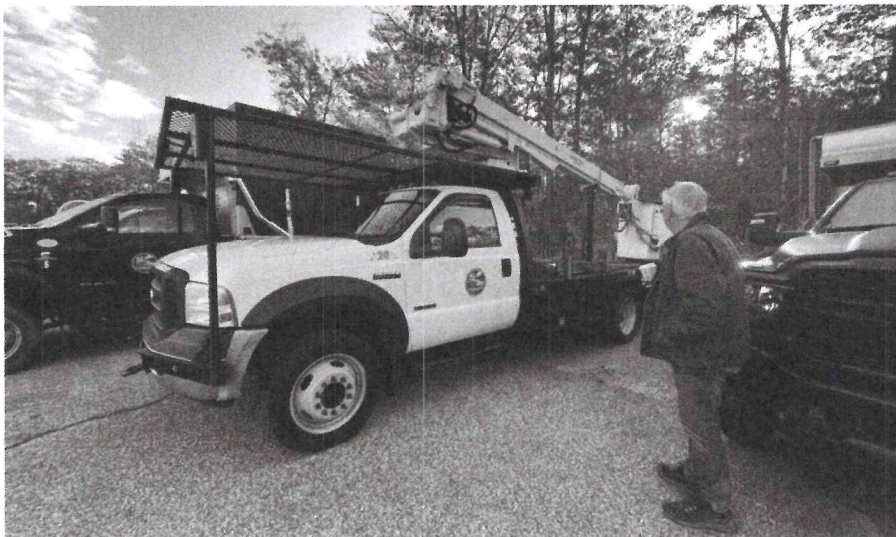
Vehicle 20: 2007 Ford F550 Bucket Truck (HWY) Scheduled Replacement Year FY2027, $150,000