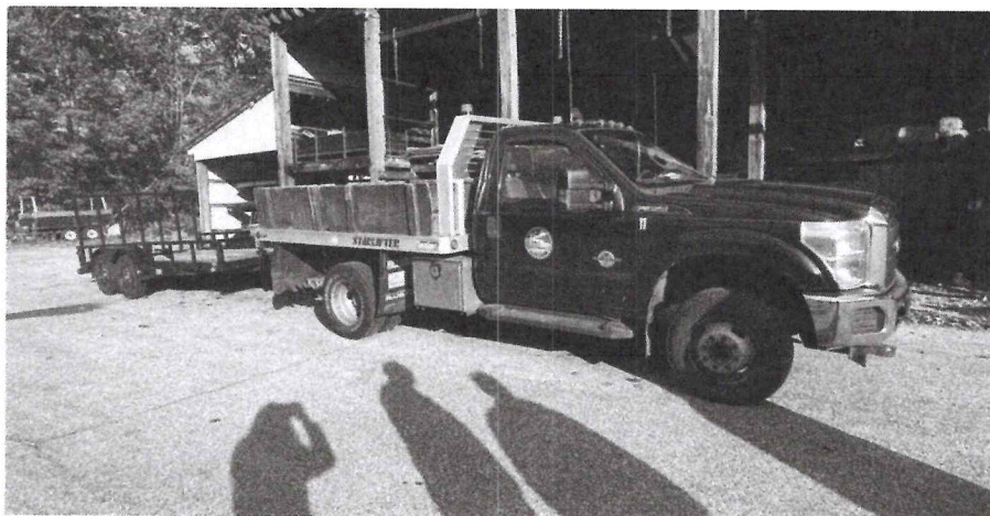
Vehicle 11: RAM 3500 4x4 Fleet Pick-up with Plow and Sander (HWY) Approved for Replacement FY2026, $110,000