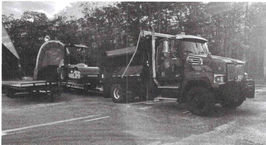
Vehicle 7: 2020 47K Dump Truck with Plow, Wing, and Sander (HWY) Scheduled Replacement Year FY2033, $200,000