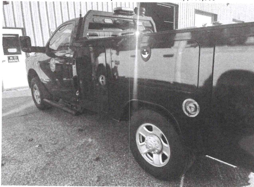
Vehicle 8: 2022 RAM 3500 4x4 Fleet Pick-Up with Plow and Sander (HWY) Scheduled Replacement Year FY2032, $110,000