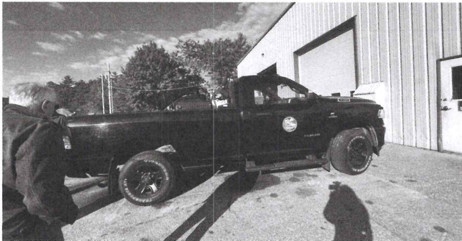
Vehicle 1: 2019 RAM 3500 4x4 Fleet Pick-Up Series (HWY) Scheduled Replacement Year FY2029, $110,000