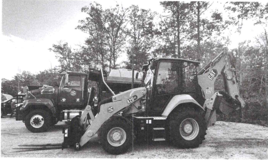
Vehicle 12: 2024 CAT 420-07XE Loader Backhoe (HWY) Scheduled Replacement Year FY2044, $200,000