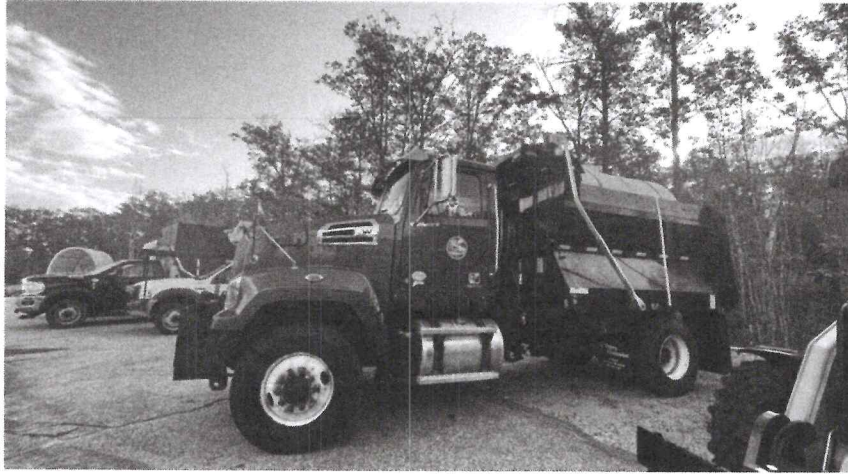
Vehicle 6: 2019 47K Dump Truck with Plow, Wing, and Sander (HWY) Scheduled Replacement Year FY2032, $200,000