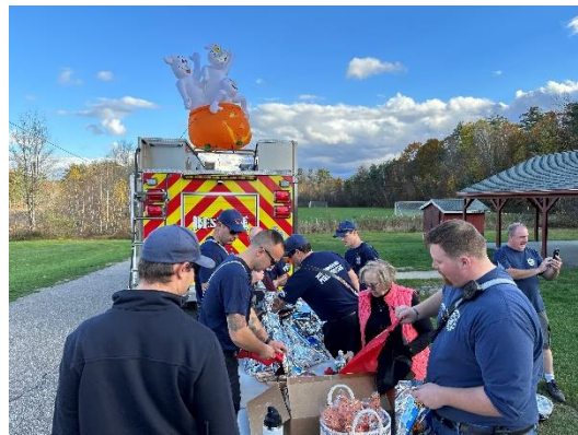
Candy Assembly Line