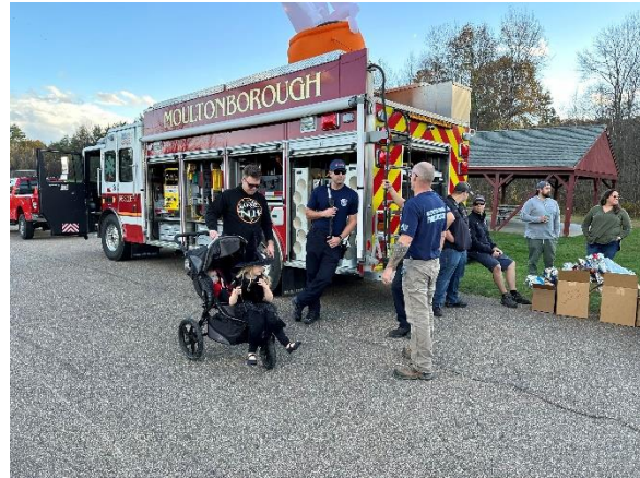
Tours of the Trucks