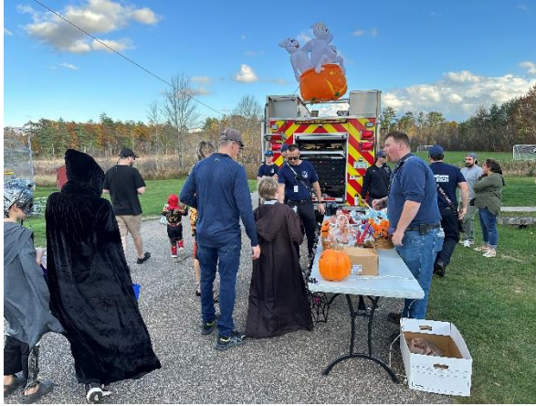
Handling out treats & Fire Prevention Swag