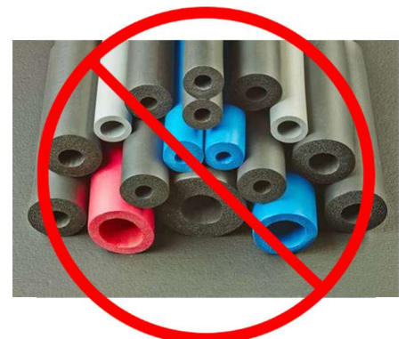
NO PIPE INSULATION