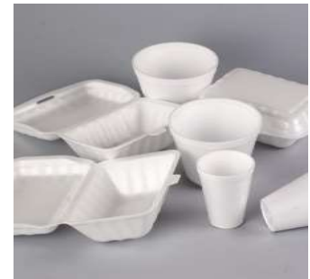
CLEAN #6 PLATES & CUPS