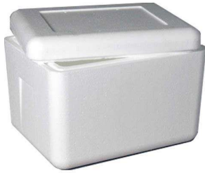
#6 FOAM COOLERS