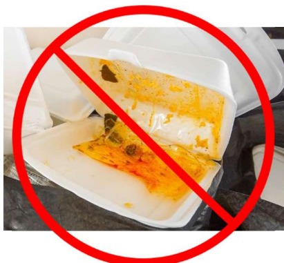
NO DIRTY FOAM PRODUCTS