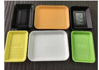
CLEAN MEAT & PRODUCE TRAYS