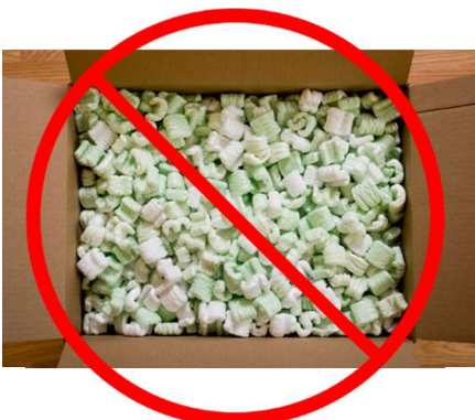
NO PACKING PEANUTS